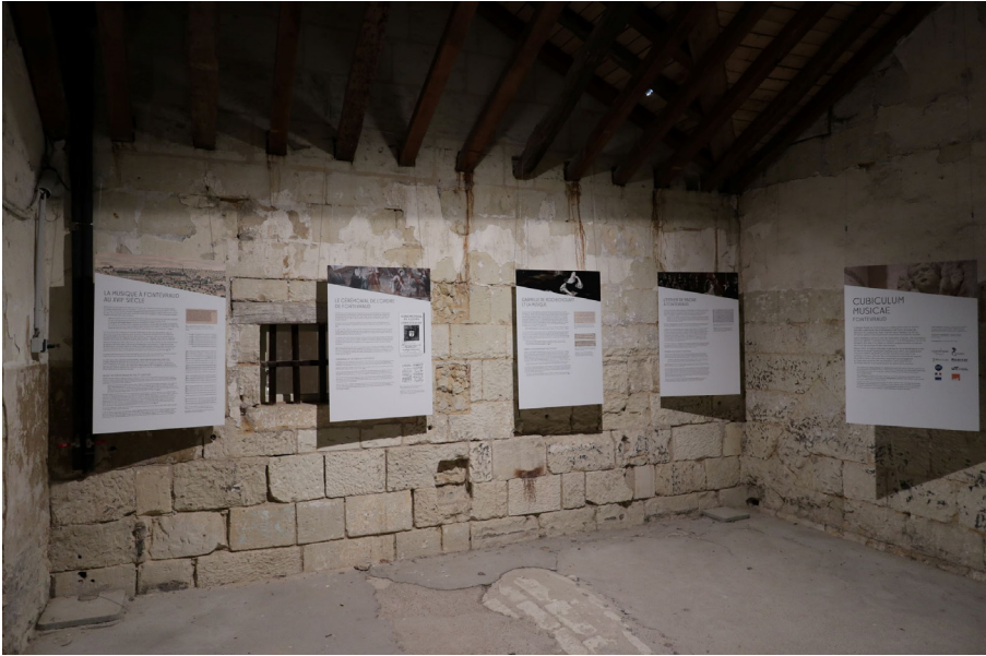
Figure 5. Cubiculum Fontevraud: document display room