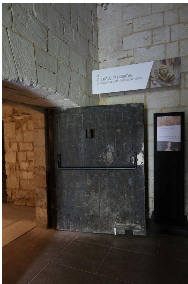
Figure 4. Cubiculum Fontevraud: entrance

Currently, we are working on a new Cubiculum dedicated to Leonardo da Vinci and the musical instruments he invented, as the Région Centre-Val de Loire will be celebrating the 500-year anniversary of his death (which occurred in 1519 at his home in Amboise) this year ( https://cubiculum-musicae.univ-tours.fr/presentation/ ). From September 2019, the Musée des Beaux -Arts at Tours