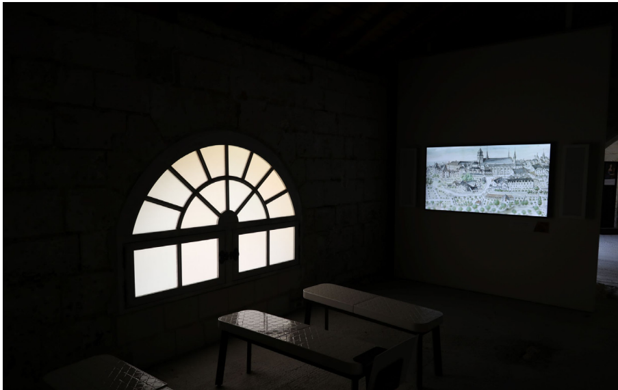
Figure 6. Cubiculum Fontevraud: musical immersion space